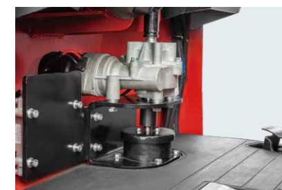
Electronic power steering system (for stand-up driving type tractor)